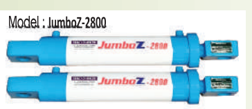
Model : JumboZ-2800

Photos are representations only. Products are under continuous improvement. Specifications and details may change without notice.