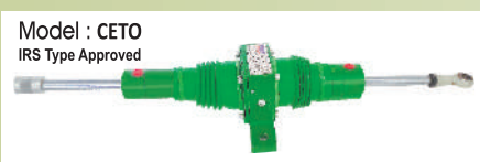
Model : CETO IRS Type Approved