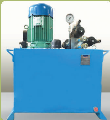
Single Electric Motor (AC) Type with IACS recommended Sensors