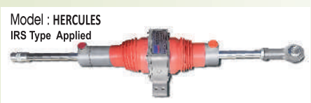
Model : HERCULES IRS Type Applied