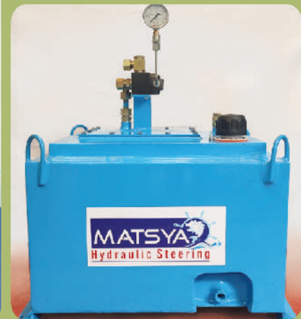
Jacketed Hydraulic Power pack