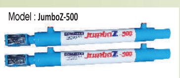
Model : JumboZ-500