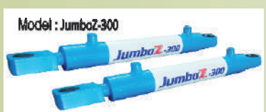
Model : JumboZ-300