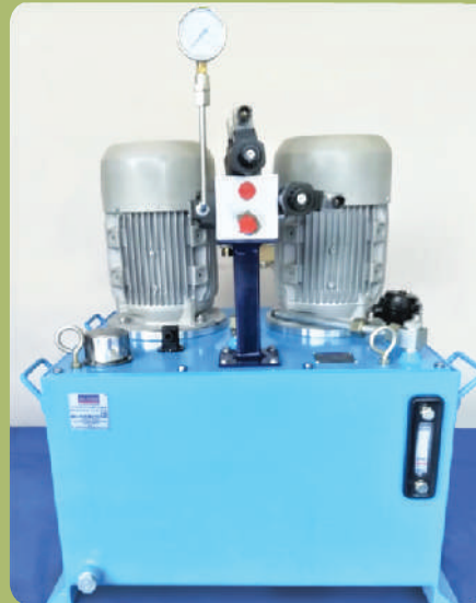
Twin Electric Motor (AC) Type with IACS recommended Sensors