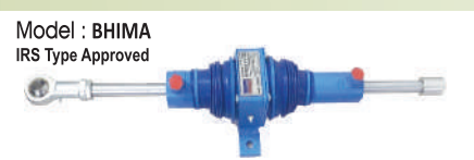
Model : BHIMA IRS Type Approved